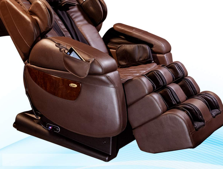
Luraco iRobotics 7 PLUS