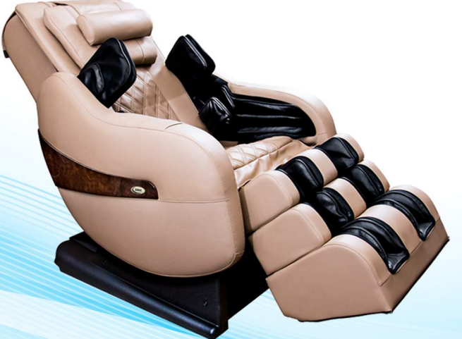
Luraco Legend PLUS L-Track